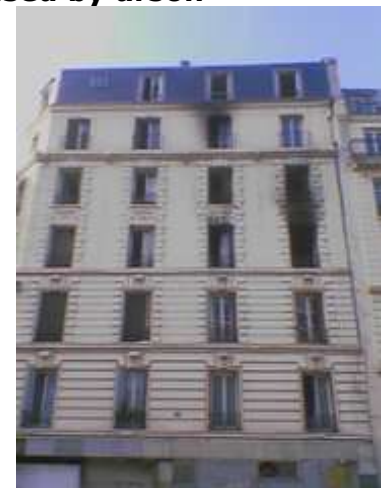
The building after the fire

The fire that broke out in a Parisian building that housed black immigrants may have been caused by criminals who commited arson, authorities announced. Activist groups denounce housing and immigration policies.