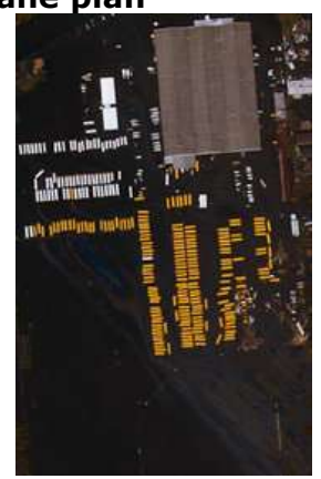
Hundreds of buses sit damaged and unused.

Controversy over whether New lack transportation and require Orleans Mayor failed to follow hurricane plan