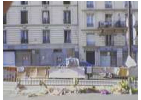
At nearby pavements, flowers honor the dead, and left-wing pamphlets denounce governmental policies on housing,

In the night of August 25 to August 26, a fire broke out a rundown apartment building located at 20, Bd Vincent Auriol in Paris, France. The building housed a number of immigrant families from Africa. These families had squatted the building illegally, until the building was bought by the local government and ran through some charity; even then, the building did not respect applicable safety norms.