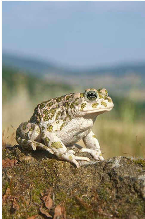
The female European green toad (Bufo viridis);