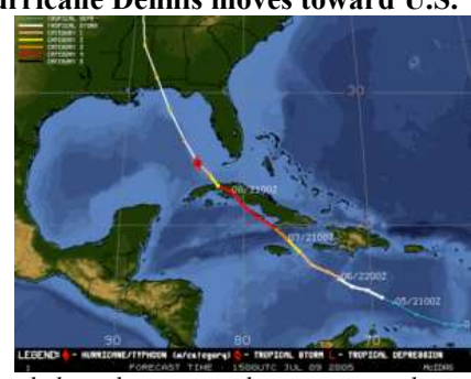
By clicking the image, a larger picture shows the key code that recorded the storms changes in intensity. CMISS Jul 8/2100Z

After scouring the Caribbean islands, Hurricane Dennis moved on toward the U.S. Gulf coast but not before its deadly fury was unleashed upon the region's many island nations.