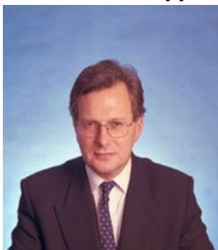
Lord Goldsmith.

The U.K. attorney general Lord Goldsmith has warned British media that further reporting of details from an allegedly leaked memo about a dispute between Tony Blair and George Bush "could