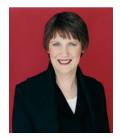
The Rt. Hon. Helen Clark

Under the Helen Clark Government, New Zealand has maintained a nuclearfree policy, thought to be at the cost of a free trade agreement with the United States of America. Clark and the Labour Party also refused to assist the United States in the Iraq invasion.