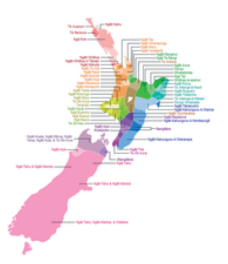
A map of the tribes of New Zealand