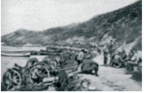
Troops on the Gallipoli shore after the first battle.

New Zealand's first act in the war was to seize German Samoa. New Zealand sent 1,413 men to conduct this action and took control of the territory without much resistance. It was the first German territory to be occupied in the name of King George V in the war.