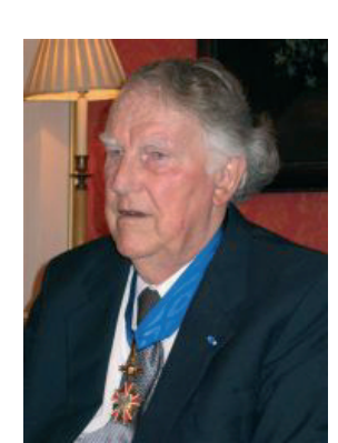
Sir Edmund Hillary in Poland, 2004.

Edmund Hillary is one of the most famous New Zealanders, and appears on the New Zealand five dollar note.