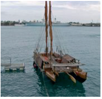
A replica Polynesian canoe Hawai'iloa in Honolulu harbour

For a long time during the nineteenth and twentieth centuries, it was believed the first inhabitants of New Zealand were the Moriori people, who hunted giant