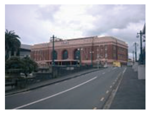
The old Auckland Railway Station

On the 5th of February 1867, the Southland Provincial Government opened a branch railway from Invercargill to Bluff. This railway was built to the international standard gauge of 4 ft 8\frac{1}{2} inches (1,435 mm). At this stage, the Central Government set the national gauge at 3 ft 6 in (1,067 mm).