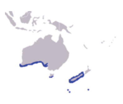
Distribution of New Zealand Fur Seals

There was a rush for seals in Dusky Sound and the West Coast in the early nineteenth century, and the seals were hunted to the verge of extinction by 1830. Sealing in New Zealand was finally outlawed in 1926.