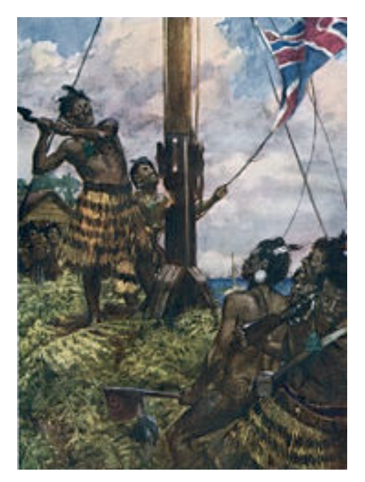
Hone Heke cutting down the British flagstaff at Kororareka.

Disputed land sales led to conflict around Wanganui. Wanganui itself was attacked by Topine Te Mamaku.