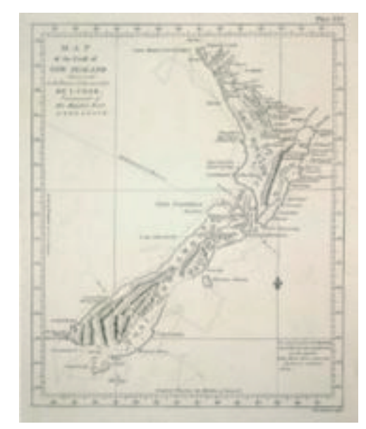
First map of New Zealand, drawn by James Cook.

Cook attempted trade with Maori again at a different location, but with no success.