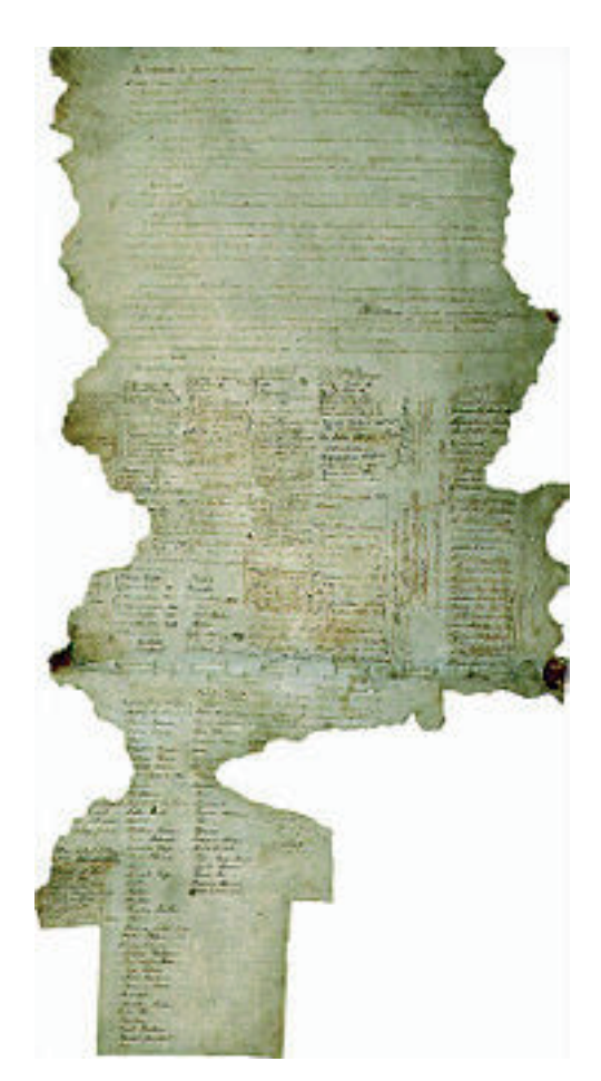
An original English version of the Treaty of Waitangi.

Article the first The Chiefs of the Confederation of the United Tribes of New Zealand and the separate and independent Chiefs who have not become members of the Confederation cede to Her Majesty the Queen of England absolutely and without reservation all the rights and powers of Sovereignty which the said Confederation or Individual Chiefs respectively exercise or