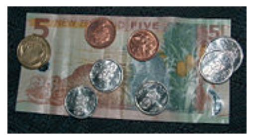
Current New Zealand coins and five dollar note under the decimal currency.