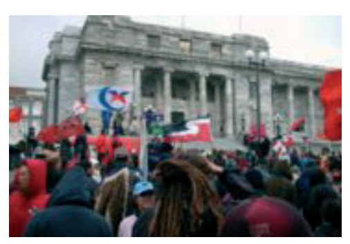
A protest outside the New Zealand Parliament over the foreshore and seabed controversy.

The New Zealand public were surprised and shocked by the claim to the beaches. The Prime Minister, Helen Clark, said that the Government would be passing law to ensure that beaches remained in public hands. However, the law incorporated Maori being consulted over foreshore and seabed matters. Due to this, the Labour Party was heavily attacked by National Party leader, Don Brash, who said the Government showed favouritism towards Maoris. Soon afterwards National was ahead of Labour in an opinion poll.