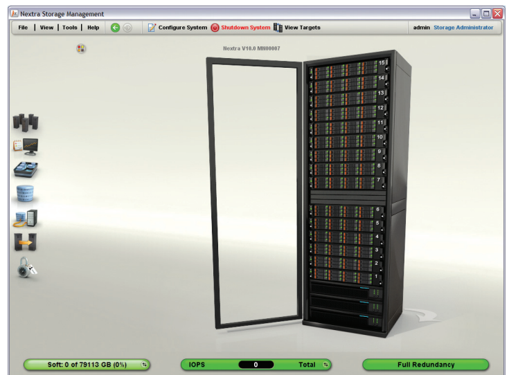
The XIV system provides an exceptionally intuitive, state-of-the-art user environment

applications, while total cost of ownership justified its use for other needs. "The XIV system provides a real solution to a full range of our storage needs, giving us a first-time-ever alternative to tiered storage hierarchy," explained Eyal Harel, Director of System & Development, Bezeq International. Facing a fiercely competitive business environment, Bezeq International found the XIV system to be a win-win solution for meeting high performing yet cost-effective storage needs while simplifying day-to-day operations. Bezeq International's XIV solution is a solid case of IT empowering a company's ability to survive and thrive.