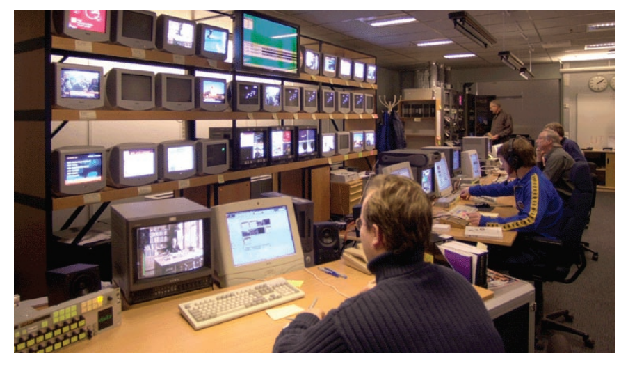
SVT, Sweden's public service television company, operates five digital channels including an around-theclock news channel and a European channel for Swedish-speaking viewers in Europe, North Africa and the Near Fast

It's a familiar nighttime routine: you settle into your armchair and click the remote to your favorite news channel. Then, a barrage of images and sounds from around the world floods your screen.