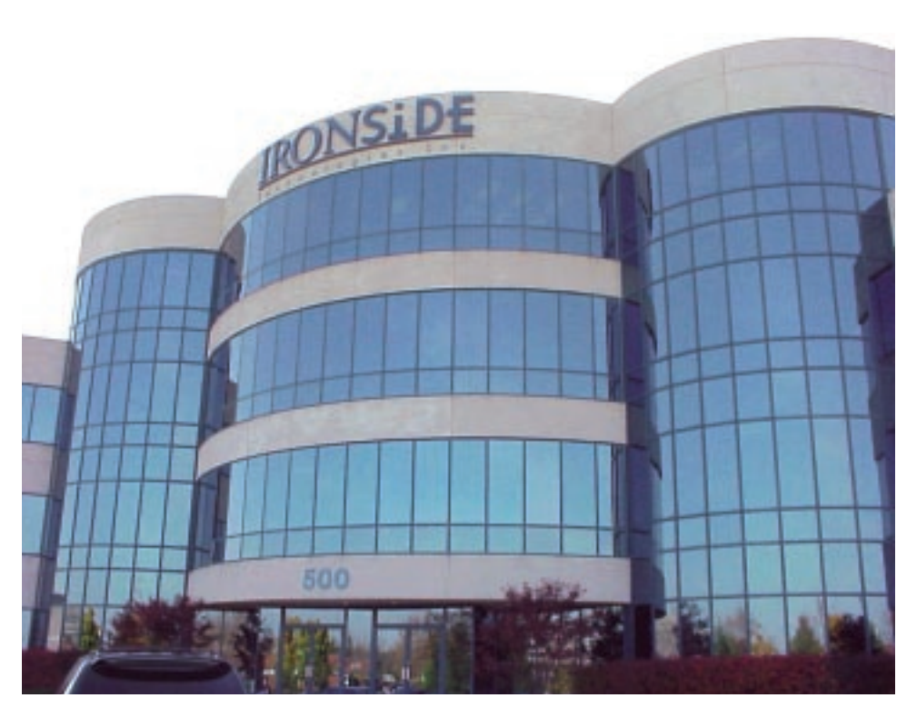
Ironside is helping manufacturers and distributors reduce order-processing costs significantly, with its integrated e-commerce solution.

In addition, with its comprehensive e-commerce solution, Ironside is able to help businesses provide their customers a new level of 24-hours-a-day, 7-days-a-week customer service. For example, explains Maceallum, "electronic commerce can help reduce costs, such as those associated with product returns and back orders, by providing customer self-service features."