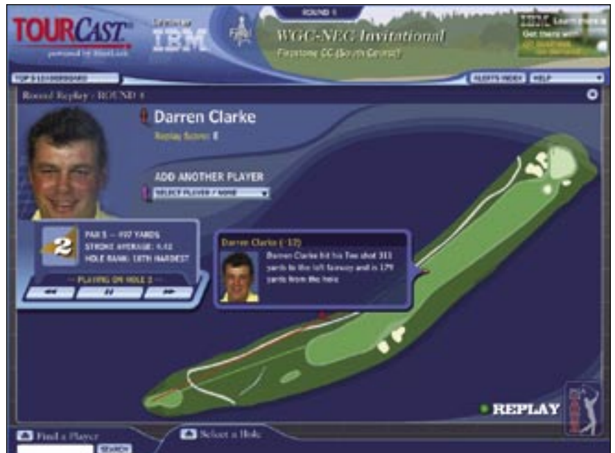
Fans can follow their favorite players in realtime online through TOURCast, no matter where players are on the course. They can even watch them play against another player who isn't in their group.

Increased revenue and fan base; ability to meet the needs of key customer groups by recording every shot by every player on every hole; ability to handle significant surges in traffic