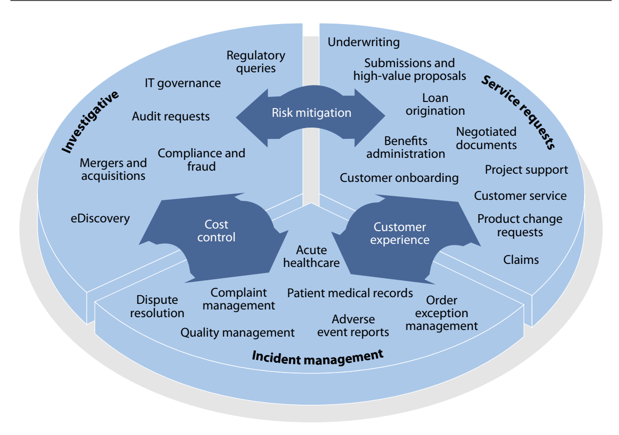
Figure 2 Three Case Management Categories