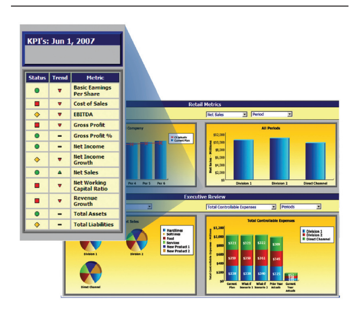
Figure 2: Dashboards allow management to monitor both process and performance.

A scorecard includes a collection of your important metrics, each with an associated target, thresholds for good and poor performance, and a clearly identified owner. However, a proper scorecard must provide more than red, green or yellow status indicators.