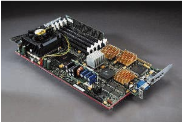
Integrated solutions for server consolidation - These products allow you to deploy PC servers without adding the costs of managing a server farm.