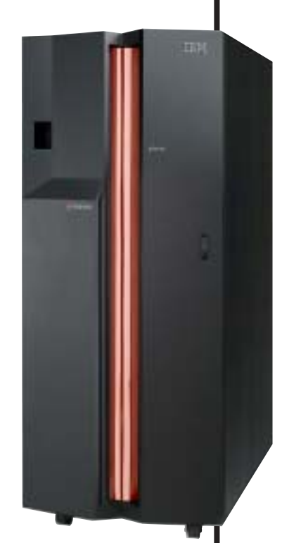
The new IBM 7800