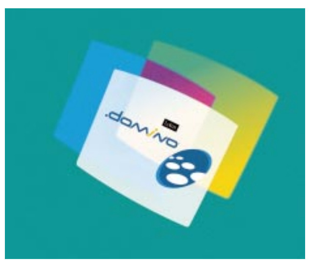
iSeries: the integrated Domino server with built-in operating system, security, database, and systems management.

Learn training offerings visit: ibm.com/training/ savings