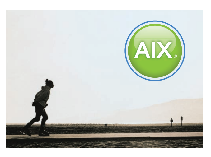
Correct: The background is uniform in tone and light enough to provide good contrast.