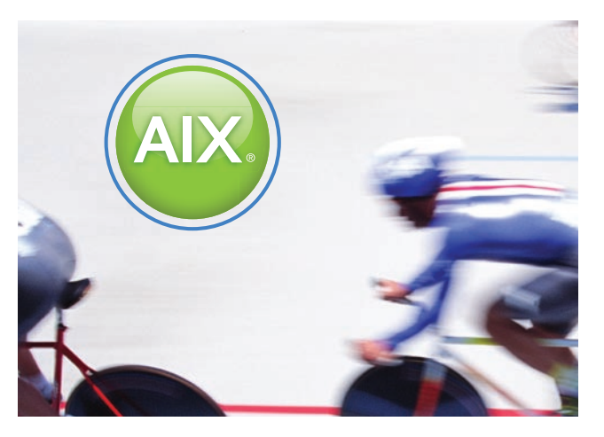
Correct: The CMYK logo is used in this 4-color image.