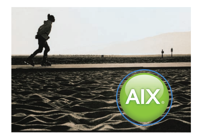
Incorrect: The background is not uniform in tone and should also be darker for use with the CMYK logo for black backgrounds.