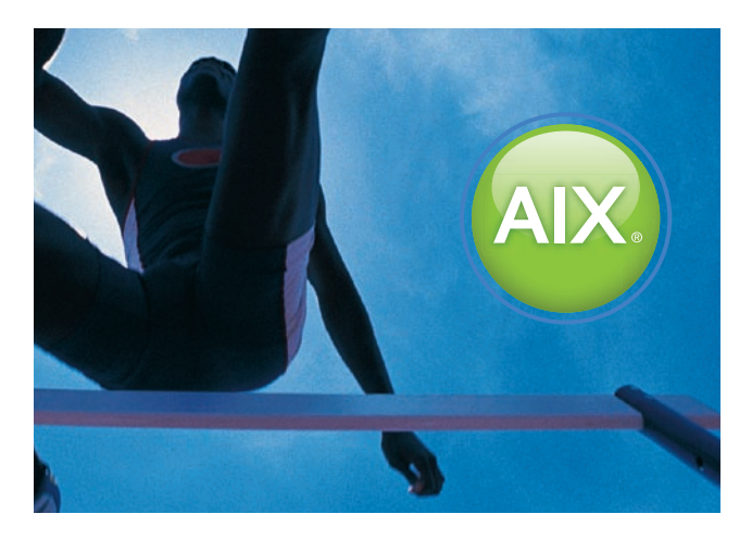
Incorrect: The background color is too close to the ring color.