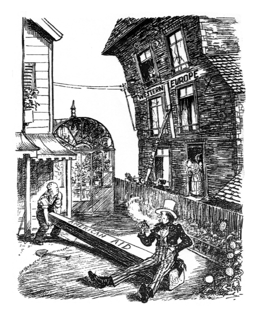
A British cartoon entitled 'Neighbours', published in October 1947. Marshall (on the left) is saying, 'Come on, Sam! It's up to us again.'