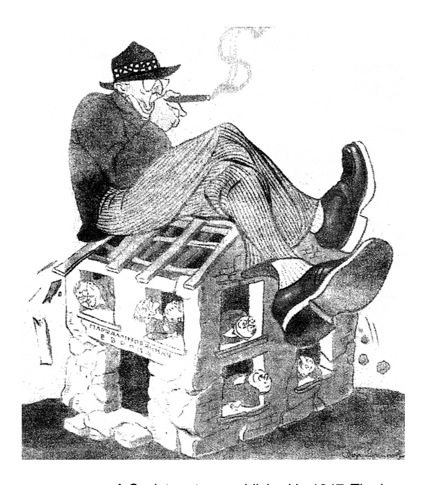
A Soviet cartoon published in 1947. The house represents Europe.