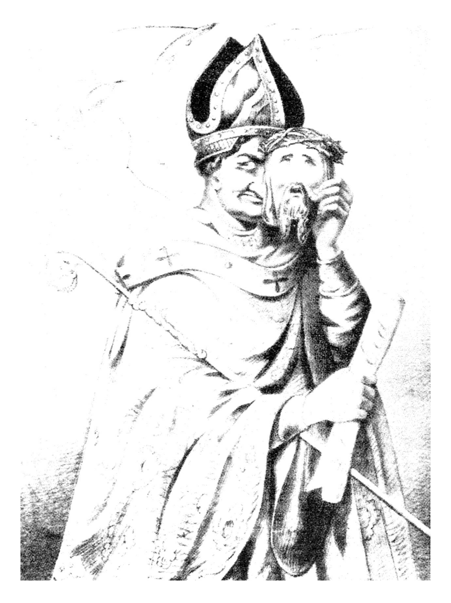
A cartoon of Pope Pius IX, published in Italy in 1852.