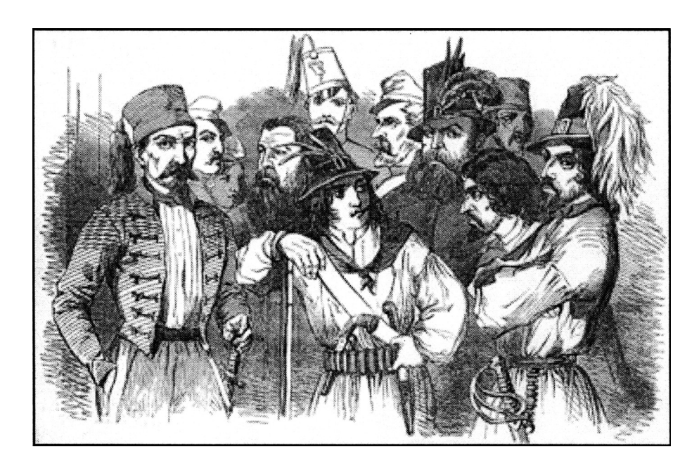
A drawing entitled 'Rome – Garibaldi's Men', published in an English magazine in July 1849.