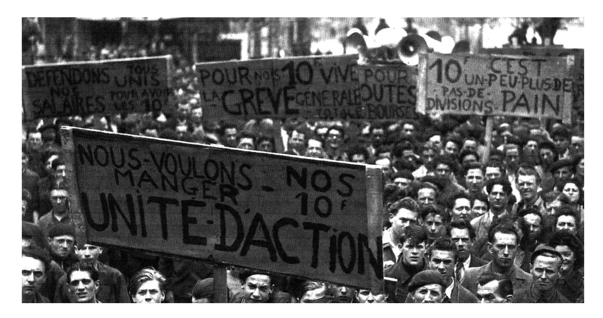
A photograph of workers in Paris demonstrating in 1947 for more pay, more bread and more united action by left-wing groups.