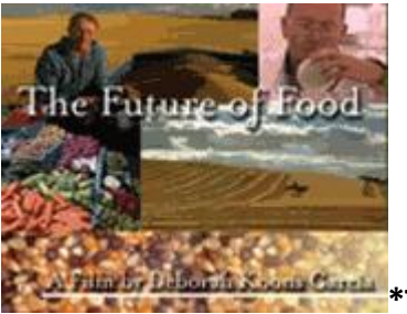
*The Future of Food*

2004, video. Lily Films. Examines the changing nature of food as multinational corporations increasingly exert control over food systems in Canada, Mexico, and the U.S. Looks at the rise in patented, unlabeled genetically engineered food, explores alternatives to industrial agriculture, and offers organic and sustainable agriculture as the solutions to the ecological, economic and cultural crisis facing North American farms. 88 minutes. Playing in New York City and other U.S. cities in September and available on DVD later in the year. Contact Lily Films, P.O. Box 895, Mill Valley, CA 94942; email info@lilyfilms.com; website http://www.thefutureoffood.com.