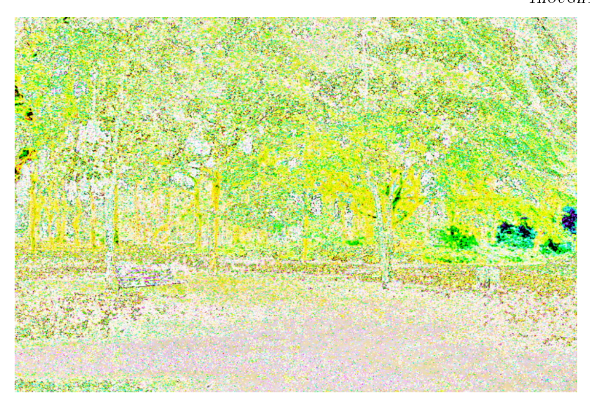
Figure 6.1: Online at www.zazzle.com/xiornikzazzle<sup>4</sup>