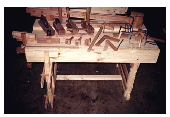
Figure 2 : A display of tools and workbench made by Aaron Moore.

Practical Action, The Schumacher Centre for Technology and Development, Bourton on Dunsmore, Rugby, Warwickshire, CV23 9QZ, UK