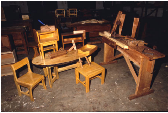
Figure 3: Furniture made in Malawi.