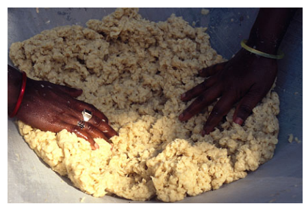
Figure 7: Mulberry pulp. Bangladesh.