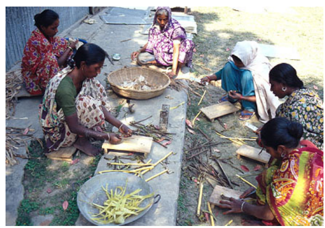
Figure 5: Women stripping mulberry and cutting jute for pulp, Bangladesh.

The process of making paper is based on wet cellulose fibres binding together in a random fashion when dried under restraint. The process of paper usually involves the initial separation of the cellulose fibres to form a wet pulp, some form of treatment, such as beating and refining, while in the pulped state, to enhance the quality of the final product, then forming of the sheet paper by hand moulding or by paper making machine, and drying. Some further processing is often carried out before or during drying to acquire the desired finish. The process is similar,