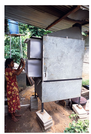
Figure 14: Indra Padmini loading paper into the dryer, (modified cashew dryer).

can speed up this process and reduce the amount of space needed. Coloured paper is sometimes dried in the shade to avoid the bleaching effect of the sun. The mechanised production, because it produces paper continuously, demands artificial drying. This is usually achieved by passing the paper through a series of heated rollers from which it emerges dry and ready for reeling. Wherever artificial drying is required it involves cost. A great deal of energy is required to remove all the water from paper and energy is expensive.