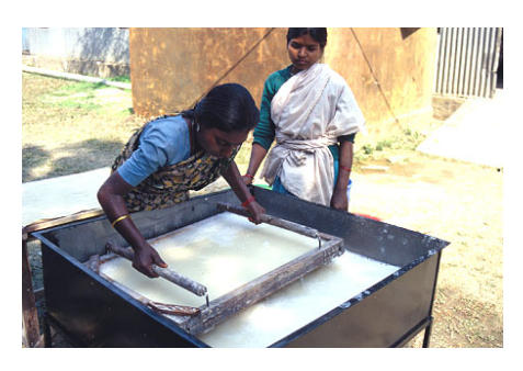
Figure 10: Forming using the dipping method with a bamboo frame.