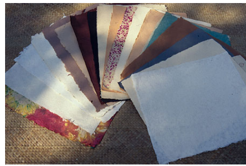
Figure 1: Range of handmade paper, Bangladesh.

When considering papermaking, there are many factors to take into account in deciding on the scale, the type of product, the raw materials, the investment and the required skill levels. In addition, there are equally as many non-technical considerations such as environmental issues, marketing and competition, consumer expectations and economics. Together, all these issues will help you decide on the viability of the operation.