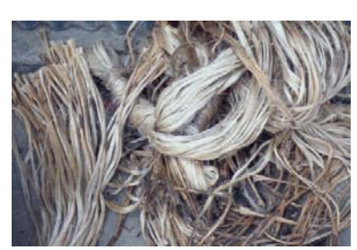
Figure 4: Jute used for paper making, Bangladesh.

worthwhile for the small-scale operator, involving as it does, even more, expensive equipment. It is a better policy to concentrate on unprinted materials if these can be obtained. Alternatively, paper with as little print as possible should be selected. When the final product is used for packaging it is sometimes acceptable to mask the discolouration due to ink by tinting the pulp to produce a coloured paper. One of the major parts of recycling is the collection, sorting, baling, and transportation of waste paper.