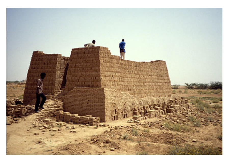
Figure 1: Large clamp kiln near Kassala, Sudan.

must fuse together when fired. When bricks are fired in a kiln or clamp a ceramic bond should be formed. Depending on the type of clay, this happens at temperatures between 900 and 1,200°C. The bond gives bricks strength and resistance to erosion by water. The temperature at which bricks are fired is critical. If it's too low, the bond is poor, resulting in a weak product. If