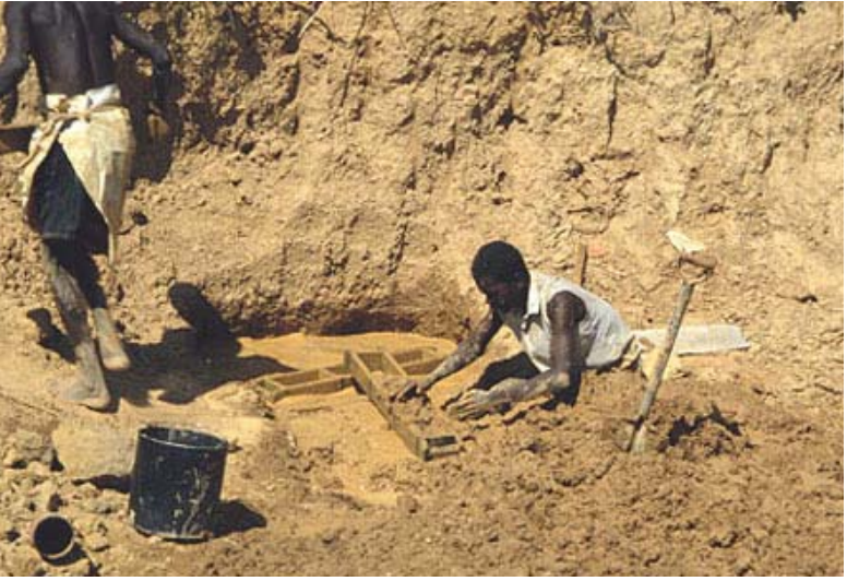
Figure 2: Slopmaking in a triple mould, Zimbabwe.

One thing which emerged from Practical Action's international work was the need for agreement on basic principles of energy efficient, cost effective brickmaking. These notes propose and briefly explain ten rules good guidelines - for energy efficiency. The rules should prove useful for brickmaking on any scale with any technology. They are not presented in any sort of priority order.