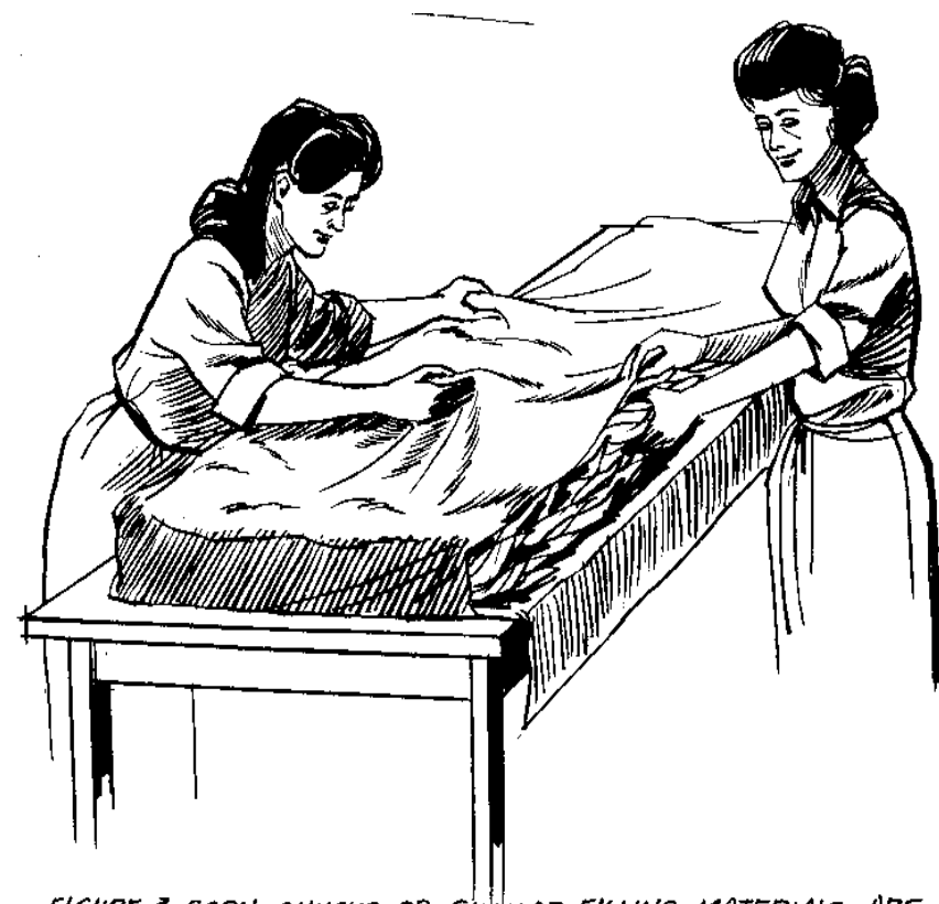
FIGURE 3. CORN SHUCKS OR SIMILAR FILLING MATERIALS ARE STUFFED INTO THE COVER, WHICH IS MADE FROM SIX PIECES OF CLOTH SEWN TO FORM A BOX WITH SQUARE CORNERS.

The first step is to dip the corn shucks in boiling water and, while they are still