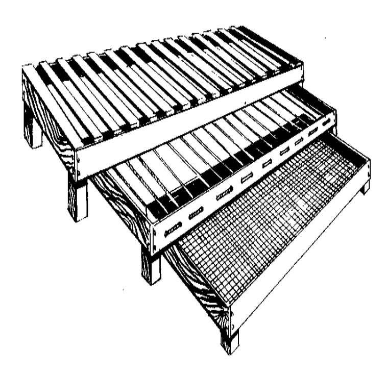
FIGURE 2. THE THREE BEDS ARE MADE TO FIT ONE UNDER THE OTHER, SAVING ON SPACE WHEN NOT IN USE .THREE DIFFERENT KINDS OF SPRING ARE SHOWN: WOOD ON THE LARGEST BED, ROPE ON THE MIDDLE-SIZE BED AND CHICKEN WIRE ON THE SMALLEST BED.