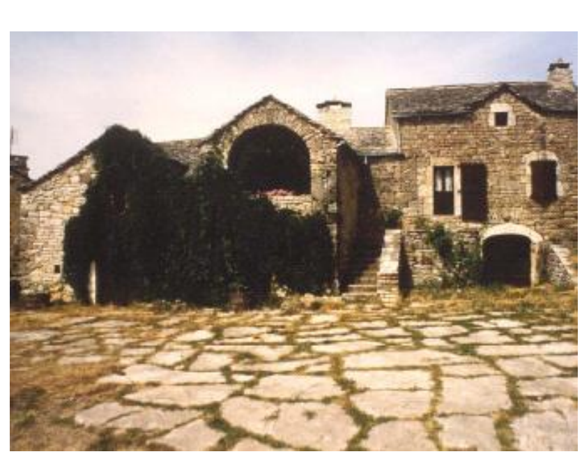
Figure 1: House, Built of stone laid in mud mortar with paving stone yard of stones in mud mortar.

A mud mortar is prepared by simply mixing soil with water until it is in a plastic (workable) state. Once applied, a mud mortar sets quite rapidly on drying without the need for elaborate curing procedures.