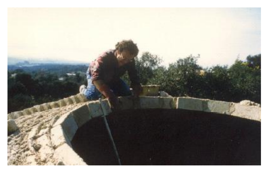
Figure 2: The good cohesion of mud mortar allows construction of vaults and cupolas without shuttering.

Mud-based mortars can be applied to masonry, monolithic walls and wattle and daub, and even to flat roofs, vaults and domes. They function as a waterproofing coat and also improve the appearance of a building. External renders are liable to wear away at a rate depending on the harshness of the exposure conditions. They require regular maintenance and periodic repair, although if well-protected they can last a very long time indeed.