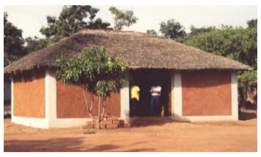
Figure 4: Demonstration house in Jos, Nigeria, built with adobe laid in mud mortar and plastered with mud mortar.

On the other hand some additional operations are necessary when the mud mortar is stabilised. To get a good homogenous distribution of the stabilizer in the mixture, it is necessary to sieve out or crush the lumps in the soil that