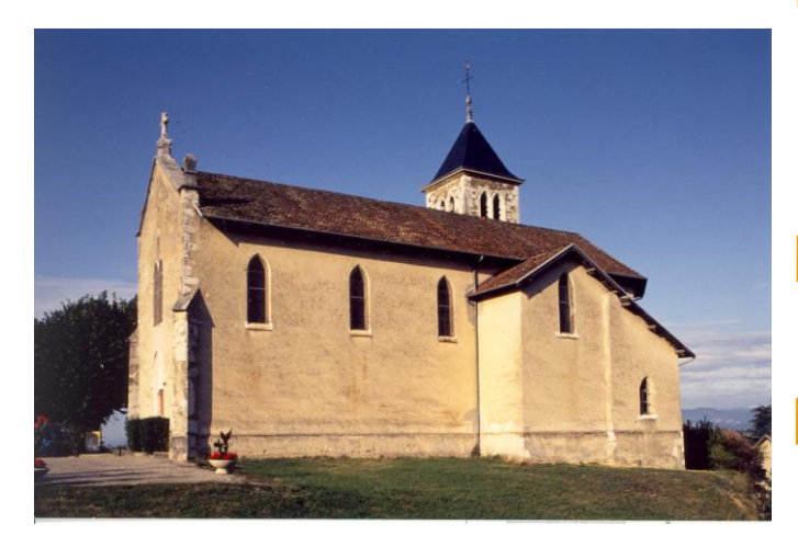
Figure 3: Church biult in pisé (rammed earth) at Charancieu in the Dauphiné region of France.

Laboratory-based tests have also been developed and these are more accurate indicators.