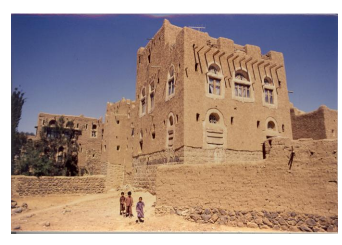
Figure 2: Private house built in the town of Amran in Yemen in 1985

For durability, earth should only be used where it is not prone to water or damp and, for maximum advantage, appropriate designs and construction techniques need to be selected. Optimum designs will depend a lot on the environment (natural drainage, water table...), the climate (rainfall quantity and intensity, and strength and direction of winds during rains...), and on the maintenance practices of the users, as well as on the sensitivity of the soil to water.