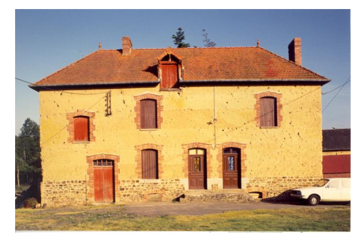
Figure 1: House near Rennes in France built at the end of the 19th Century

Clays have a variety of uses, especially for ceramics, but it is their use as binding materials in the unfired state which is described in this leaflet. Although they have the limitation that they soften when wetted, they are also undoubtedly the