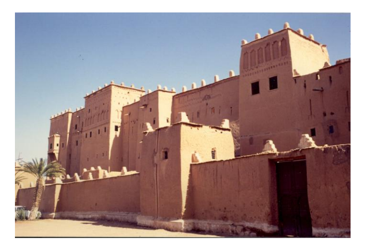
Figure 4: The Kasbah of the Glaoui at Ouarzazate in Morocco. Built by the beginning of the 20th century.

Plasters or renders are important in protecting walls from damage by rain, wind and abrasion, as well as for decorative effect, and earth-based materials are quite often used. Mud mortars are an ideal jointing material for use in earthen based walls and other structures as well as in