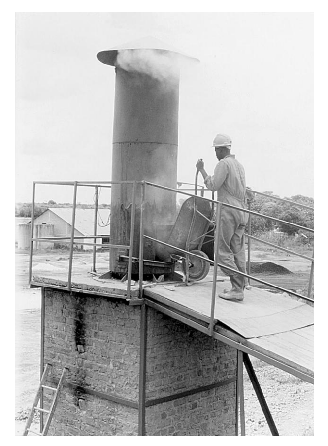
Figure 1: Loading stone/fuel through the hopper at the chimney level, lime kiln, Chegutu, Zimbabwe

If simple, field methods are to be used, it is easier to test the quality of 'lime' when it is in the form of quicklime, i.e. calcium oxide CaO. This would be the case if the lime were being bought direct from a kiln before the kiln operator had started to hydrate it. Usually, though, as quicklime will deteriorate if left exposed to the air and because it can be a hazardous material to handle, lime is more usually available and purchased as hydrated or 'slaked' lime, i.e. calcium hydroxide Ca(OH)<sub>2</sub>.