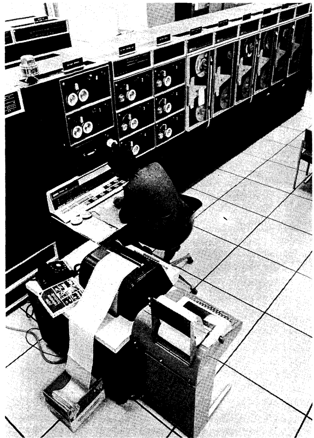
Time-sharing is alive and well in Canada, as exemplified by this view of Dataline Systems' dual DECSYSTEM-1050 installation in Toronto.

If you'll be writing your own programs, go ahead and prepare one or more of them, in the language of your choice. Then ask each of the prospective suppliers to loan you an appropriate terminal plus the computer time required to compile, test, and execute your programs. If you'll be using a ready-made application program supplied by the time-sharing vendor, prepare some representative test data, borrow the necessary terminal, and give the program a real tryout. In either case, be sure to: (1) control all test conditions as carefully as you can; (2) make the benchmark programs and data as representative of your actual workload as time permits; (3) run each test at both peak and off-peak hours (and at the same times of day for all prospective suppliers); and