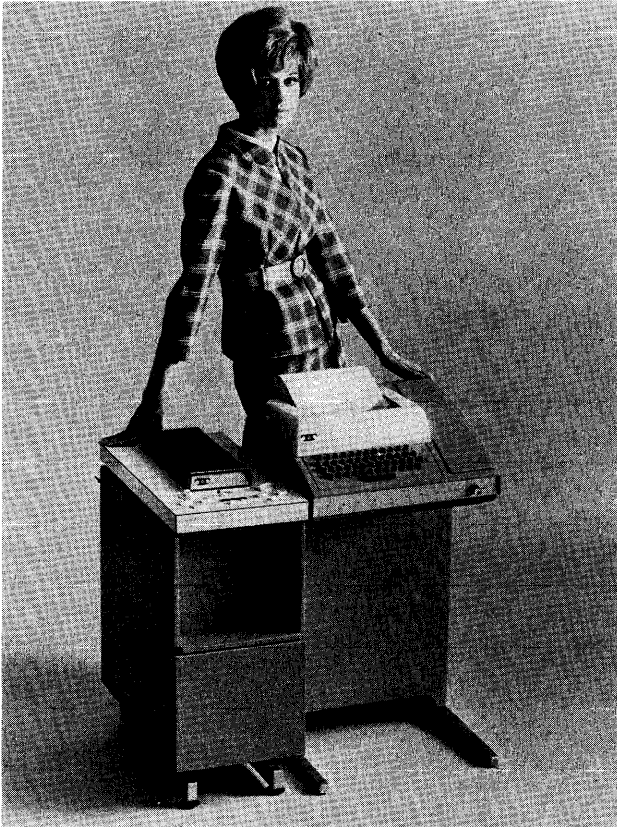
The economical Teletype Model 33 terminals (shown here with Teletype's new, cartridge-loaded Magnetic Tape Data Terminal) are by far the most widely used terminals for time-sharing applications.