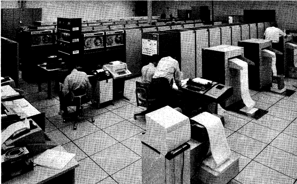
This bank of three Xerox Sigma 7 computers in Los Angeles serves users of Xerox Computer Services' Interactive Accounting System.

▷ and operating your own. What's more, recent FCC decisions have opened the way for independent carriers to provide cheaper and more flexible data transmission facilities, which should spur further progress in this area. (It should be noted, however, that considerations of communications reliability, access control, file security, and flexibility of the available data manipulation and retrieval languages become particularly important in this type of application.)