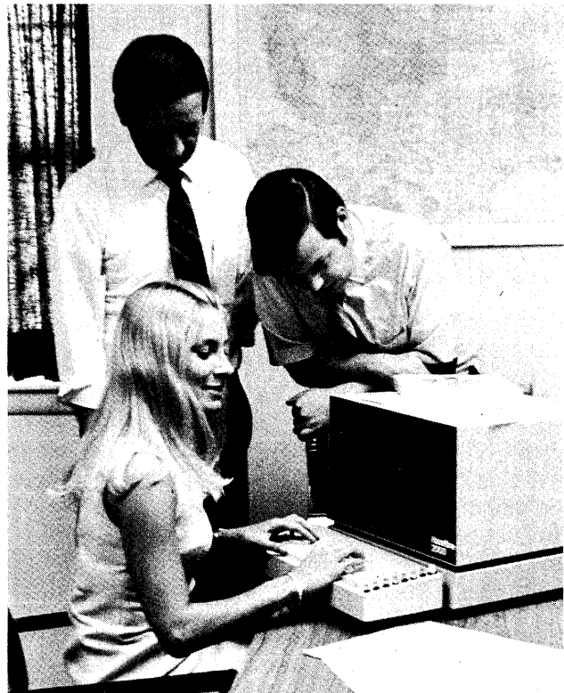
Time-sharing users enter data into one of Applied Logic Corporation's PDP-10 computer systems by means of a Hazeltine 2000, a popular teletype-compatible CRT display terminal.

Total revenues for on-line data processing services, including both interactive time-sharing and remote batch >