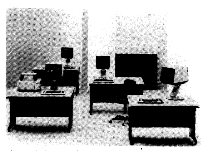
The Nixdorf 8860 Information System provides distributed processing in a Cobol-oriented environment. It also offers extensive communications and emulation facilities.

The Nixdorf 8860 can be configured as a standalone workstation or as a cluster controller capable of supporting up to 32 workstations. The series consists of five models: the