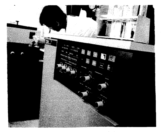
The IBM System/7 can operate as a stand-alone system or in conjunction with other IBM computer systems in sensor-based applications that range from apartment house security control systems to telephone network controllers. Shown here as a laboratory automation system, the System/7 can handle readings from multiple measuring and testing devices.

IBM also offers purchase options for the S/7 equipment. With this plan, users can accumulate up to 36 months of