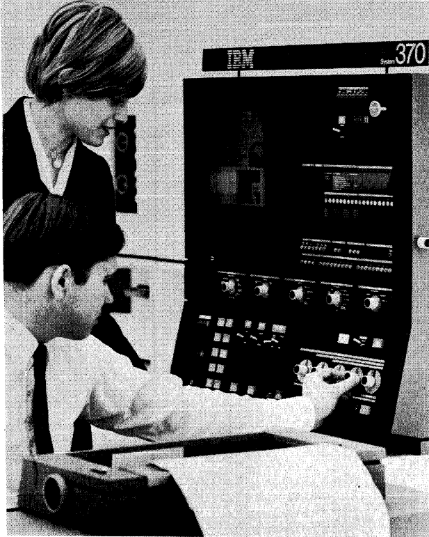
This view of the Model 135 console shows the small, read-only disk drive (top center) that is used to load the system control microprograms into reloadable control storage.