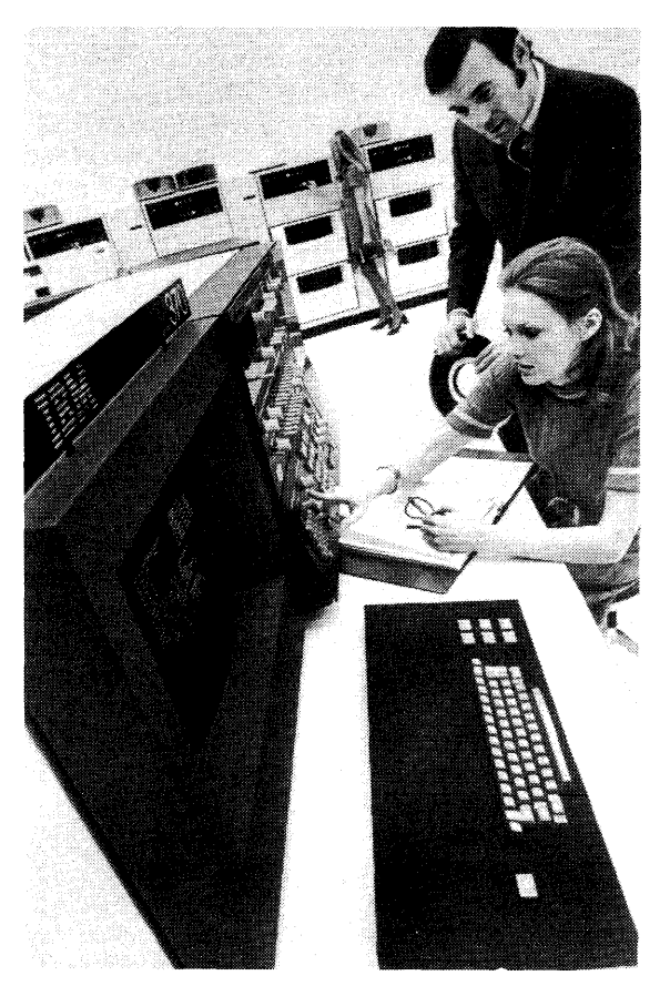
The largest of IBM's virtual storage computers, the Model 168 and its enhanced successor, the Model 168-3, offer up to 8 million bytes of real MOS main storage. A dual-processor Model 168 MP system can include up to 16 million bytes. The Model 168-3, announced in March 1975, features a 5 to 13 percent increase in instruction execution rates and a new Service Processor that expedites on-line error analysis.

There are four models of the 3350, of which two (the -F units) use both fixed- and moving-head access mechanisms and two use only moving heads. Models A2 and A2F are two-drive units that attach to System/370 Model 135, 155-II, and 165-II systems through the 3830 Model 2 Controller and to System/370 Models 145, 158, and 168 through either the Integrated Storage Controller or the 3830 Model 2 Controller. Each 3350 Direct-Access Storage subsystem must include one A2 or A2F unit. Up to three B2 or B2F units, each of which also contains two drives, can be added to the subsystem to achieve the