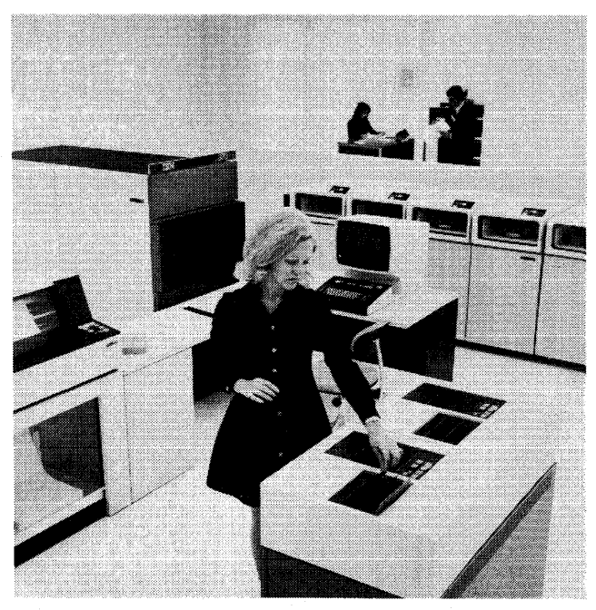
The Model 115-2, introduced in November 1975, is an enhanced version of the smallest member of the expansive System/370 family. As compared to the original Model 115, the 115-2 features internal processing speeds from 55 to 75 percent higher, an expanded 262K-byte main storage capacity, and twice the disk storage capacity (up to eight 3340 spindles, or 558 million bytes). The 115-2 is available in cardless configurations that employ the 3540 Diskette Input/Output Unit, shown in the foreground, in place of the usual card reader and punch.