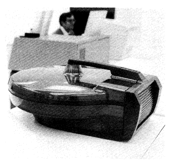
The 3348 Data Module, used in IBM's 3340 "Winchester" Direct Access Storage Facility, stores up to 35 million or 70 million bytes of data and combines the disks, access arms, and read/write heads into a single sealed cartridge.

Model 135 was introduced in March 1971 and enhanced through the addition of virtual storage capabilities in August 1972. Its distinctive features include 98K to 524K ▶