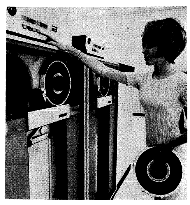
The IBM 3420 Magnetic Tape Units, introduced in November 1970, provide high performance (up to 320,000 bytes per second) at far lower prices than previous IBM tape drives.

Administrative Terminal System-OS, DOS Advanced Life Information System-DOS Attached Support Processor System-OS Automated Chemistry-DOS Bill of Material Processor-BOS/DOS Communication Control Application Program-BPS Continuous System Modeling-OS Coursewriter III Decision Logic Translator—DOS Demand Deposit Accounting-BOS Document Processing System-OS FLOWCHART-DOS 1400 Autocoder to COBOL Conversion Aid-OS General-Purpose Simulation System-OS, DOS Inventory Control-DOS Linear Programming System-DOS Mathematical Programming System-OS Matrix Language-OS Mechanism Design System; Kinematics-OS, DOS Medical Information System Programs-DOS Mortgage Loan—BOS Numerical Control Processors—OS, DOS On-Line Teller-BOS Optimum Bond Bidding-BOS Problem Language Analyzer-OS, DOS Product Structure Retrieval-BOS/DOS Program for Optical System Design/II-OS, DOS Project Control System-DOS Project Management System-OS Property and Liability Information System-DOS Remote Access Computing-BPS