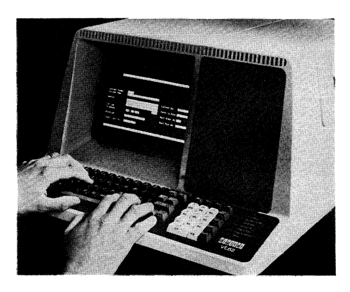
The new forms-oriented VT62 display terminal for DEC's TRAX system includes reverse video display, automatic cursor positioning, error detection features, and special message displays. PDP-11/70 TRAX systems can support up to 64 VT62 terminals.

Applications included time-sharing services, software development, accounting, production control, sales analysis, and inventory control. All of the systems were being used